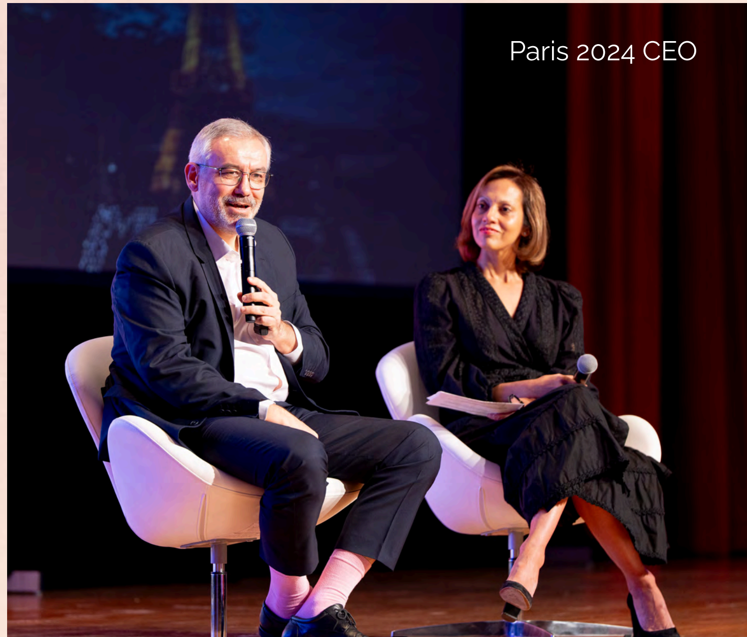
Paris 2024 CEO