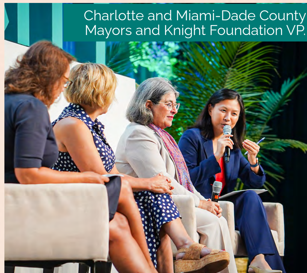
Charlotte and Miami-Dade County Mayors and Knight Foundation VP.