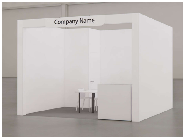
Front view – Stand with 1 open side | sample image