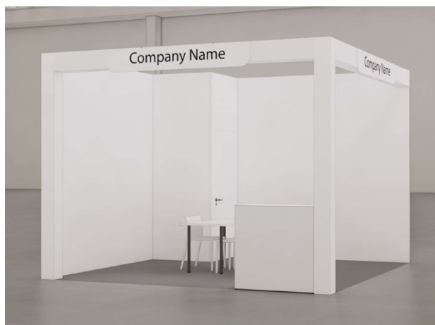
Front view – Stand with 2 open sides | sample image

For more information: zoomark.setup@henoto.com