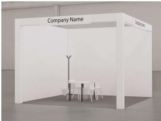
Front view – Stand with 2 open sides | sample image

For more information: zoomark.setup@henoto.com