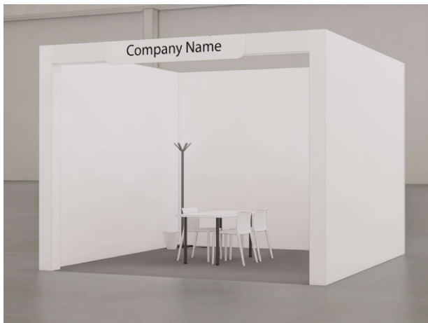
Front view – Stand with 1 open side | sample image