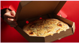
Food Processing & Packaging Technology