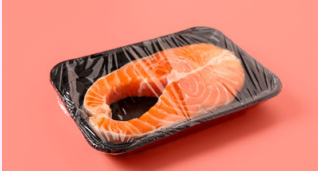
Chilled & Frozen Food