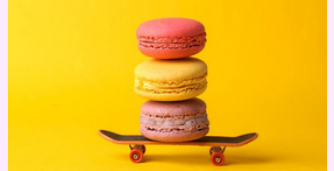
Sweet & Confectionery