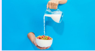
Cereals, Edible Fruit & Nuts