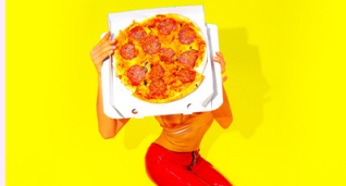
Convenient & Ready to Eat Food