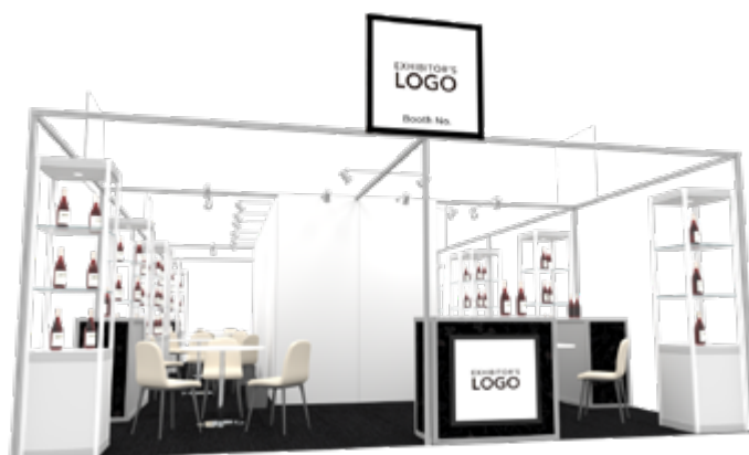
EXAMPLE OF A STANDARD TURNKEY STAND 4 OPEN SIDES - 72 SQ.M