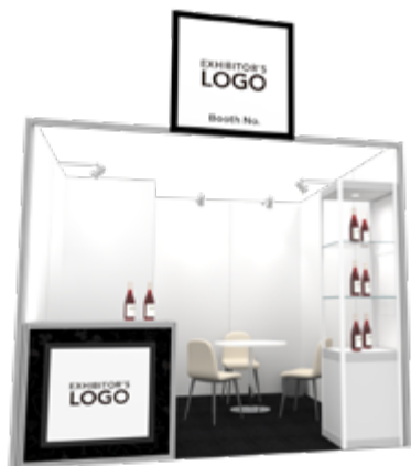
EXAMPLE OF A STANDARD TURNKEY STAND 1 OPEN SIDE - 9 SQ.M

Book a stand equipment corresponding to the raw space booked. Optional: options and special requests will be quoted on demand.