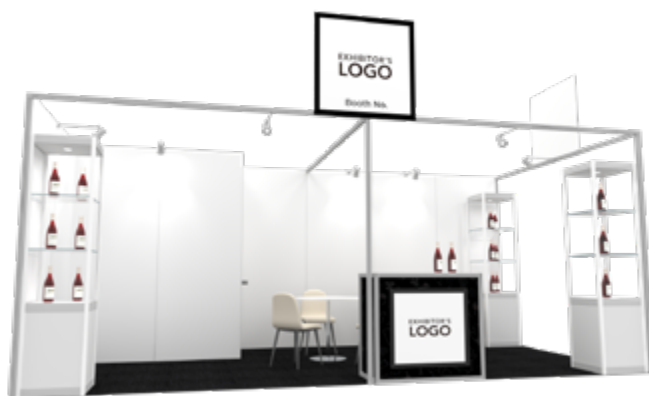
EXAMPLE OF A STANDARD TURNKEY STAND 2 OPEN SIDES - 18 SQ.M