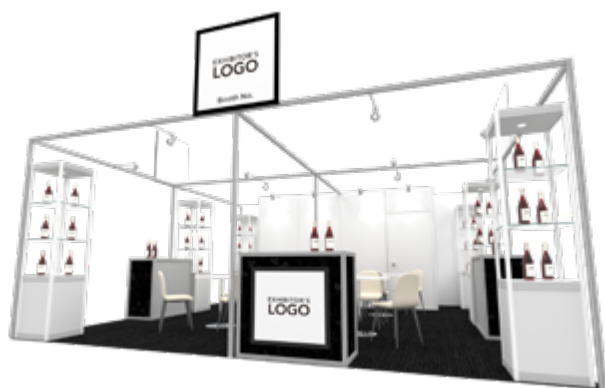
EXAMPLE OF A STANDARD TURNKEY STAND 3 OPEN SIDES - 36 SQ.M