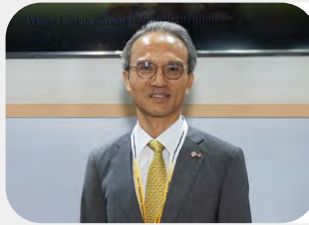
H.E. Yeo Seung-bae Ambassador of the Republic of Korea to Malaysia