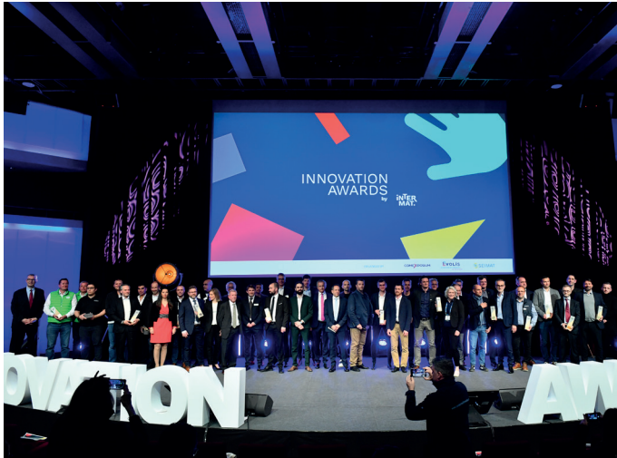
▲ The winners of the 2024 INTERMAT Innovation Awards