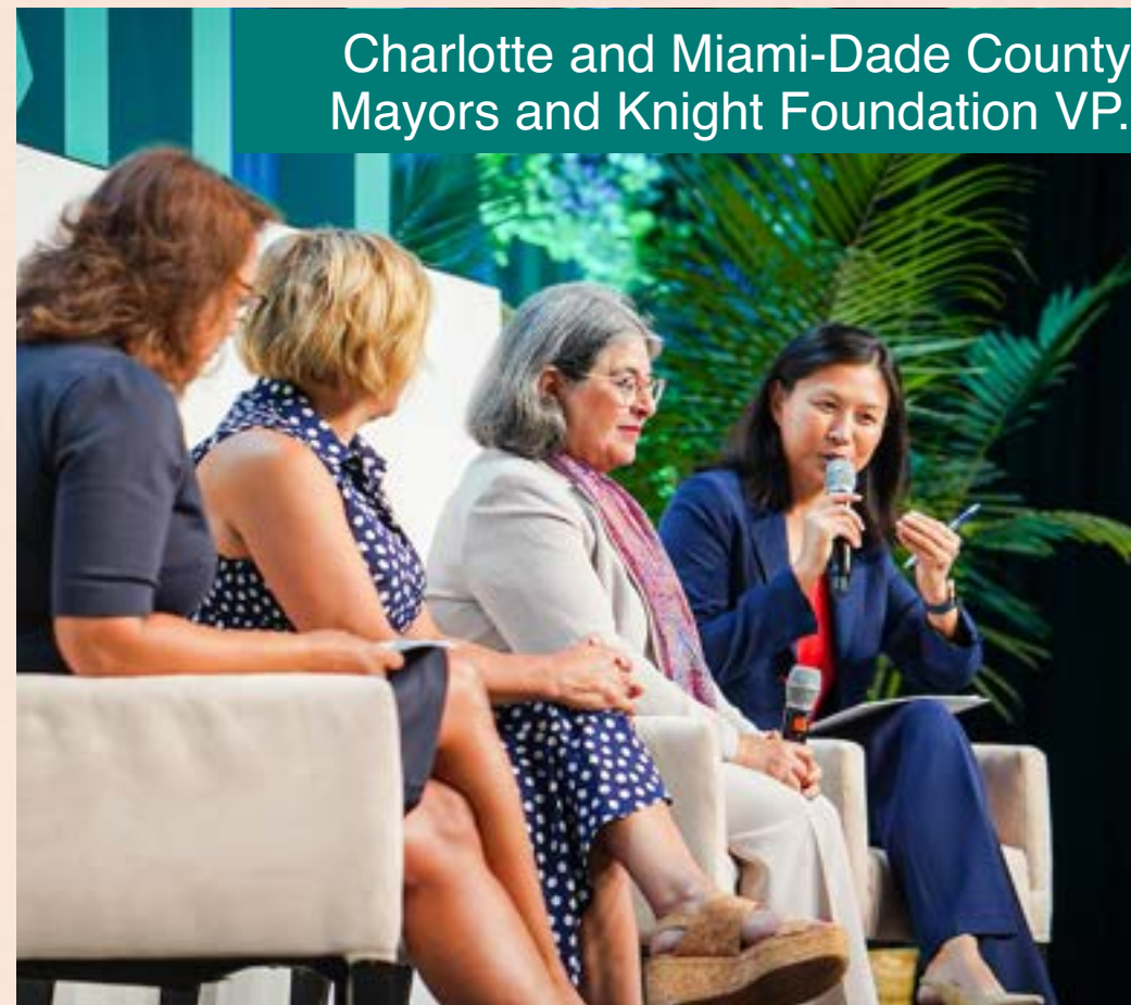
Charlotte and Miami-Dade County Mayors and Knight Foundation VP.