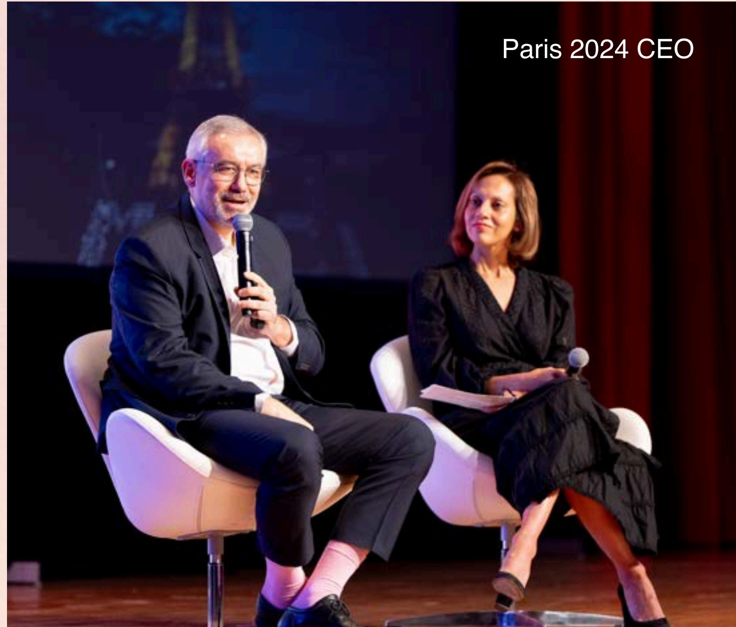
Paris 2024 CEO