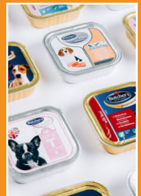
MACHINERY & PACKAGING SOLUTIONS