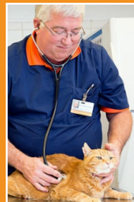
VETERINARY PRODUCTS & DEVICES