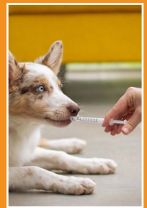
PET MEDICINE & SUPPLEMENTS