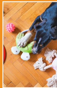
PET PRODUCTS & ACCESSORIES