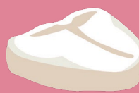
MEAT & POULTRY