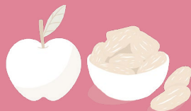
FRESH & DRIED FRUITS