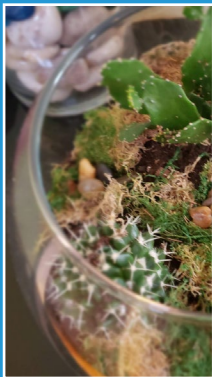
AQUARIUMS & TERRARIUMS