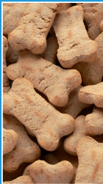
FUNCTIONAL SNACKS & TREATS