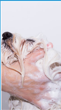
HYGIENE & WELLNESS PRODUCTS