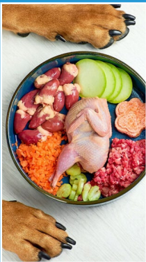
FOOD INGREDIENTS & PACKAGING